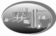
Motive Power Systems