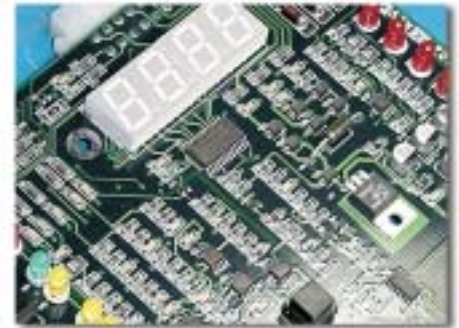
AT Series Main Control Card